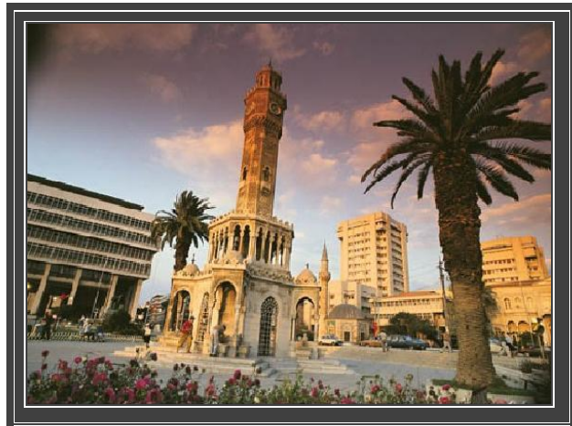
İzmir – Smyrna

Day 07 -Check out of the hotel and drive to İzmir Smyrna for a city tour. Visit Polikarp Church . Fly to Istanbul in the evening and check into hotel for overnight stay. (B / L / D)