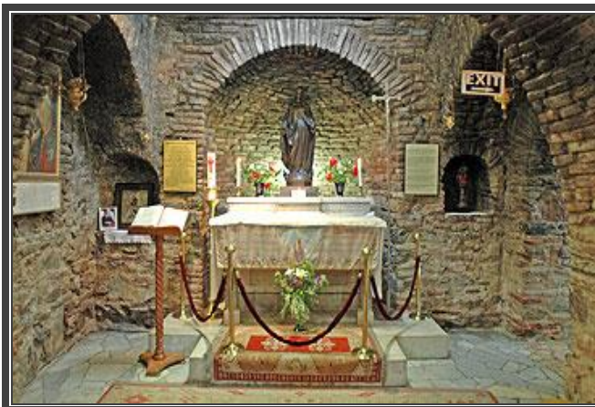
Virgin Mary House – Kusadası

Day 02 -Transfer to the airport and fly to "İzmir" ( Smyrna ). Transfer to Kuşadası and check into hotel. After lunch, visit Efes (Ephesus) one of the most impressive & famous archeological sites in Turkey and House of Virgin Mary . Return to hotel for overnight stay. (B / L / D)