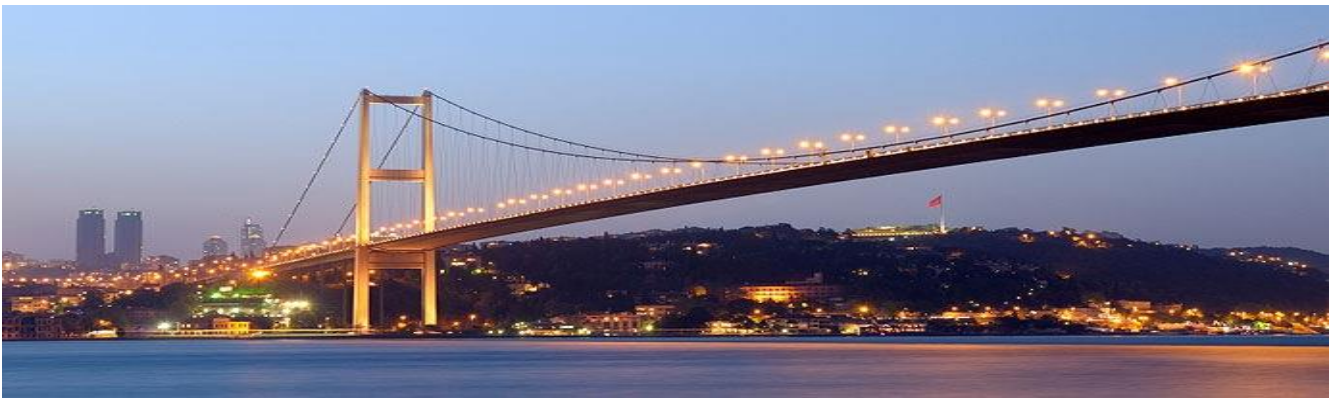
Istanbul Bosphorus Bridge

Hotels : All accommodations are in 5 stars during the trip; ( B : breakfast / L : lunch / D : Dinner)