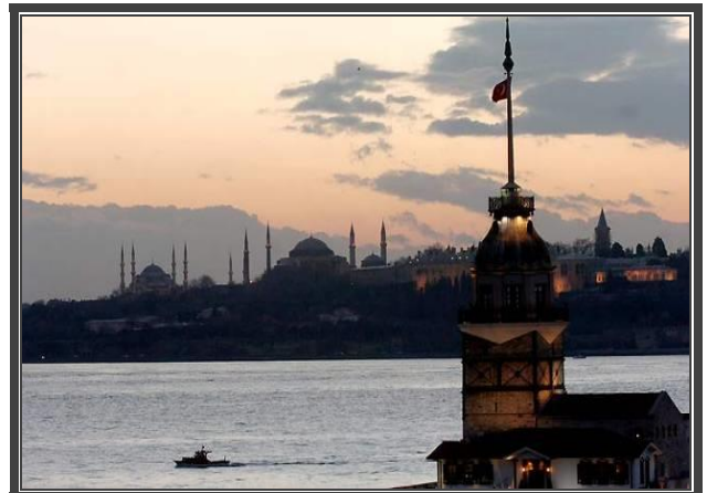
Kız Kulesi(Maiden Tower) – Istanbul