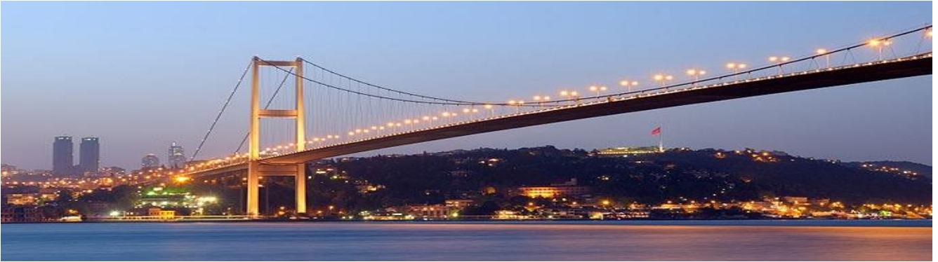
Istanbul Bosphorus Bridge

Also known as "Anatolia", the beautiful land of Turkey has one million years of stunning historical, cultural, natural and biblical riches. Turkey's history goes back to the beginning of civilization. The earliest known inhabitants appeared at Catal Hoyuk, located in - Central Anatolia, in 10,000 B.C. One of the first civilizations was known as the Hittites. When Noah made his magnificent journey during the great flood, he settled his ark in Mount Ararat (Ağrı), Eastern Anatolia. When the Apostle Paul made his missionary journeys, he traveled through the Southeast, Mediterranean, Aegean and Marmara Regions of Turkey.