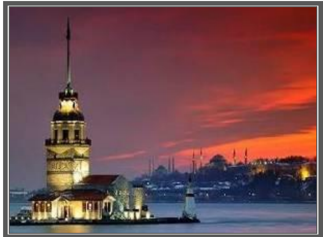
Kız Kulesi- view from Bosphorus

Day 02..... First full day for touring. After breakfast, visit Topkapı Palace -built up mainly in the 15th., century, the palace where Ottoman Empire Sultans lived for centuries and rich Ottoman treasure can be seen in its museum. Continue with historical surroundings such as the Hippodrome - a center of Byzantine civic life and basilica. At mid day, have a nice lunch at a nice restaurant in the Sultan Ahmet area . In the afternoon, visit the Hagia Sophia Museum (one of the well preserved great churches of Byzantine times, built by Byzantine Emperor Justinian in 6th century. Drive back to the hotel and dress for Turkish Dinner Night where you can taste great samples of Turkish cuisine and have fun watching the belly dancing show. Overnight. ( B / L / D )